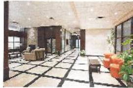
Crowne Plaza Hotel & Conference Centre 150 King Street East, Hamilton, ON